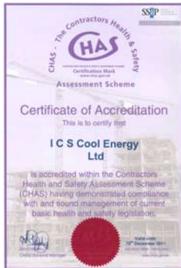
ICS Cool Energy on CHAS website